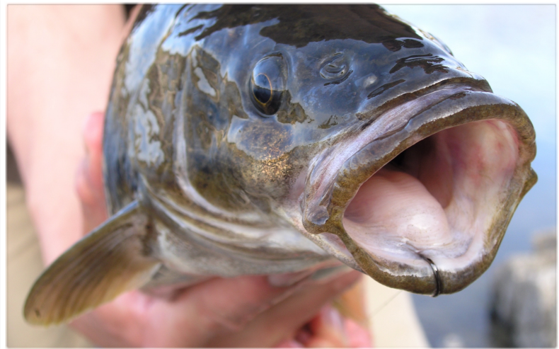
Roundtail chub, Gila robusta